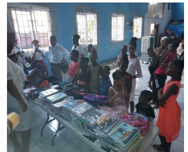
Barrels arrive (Jamaica) School Supplies & more Distributed